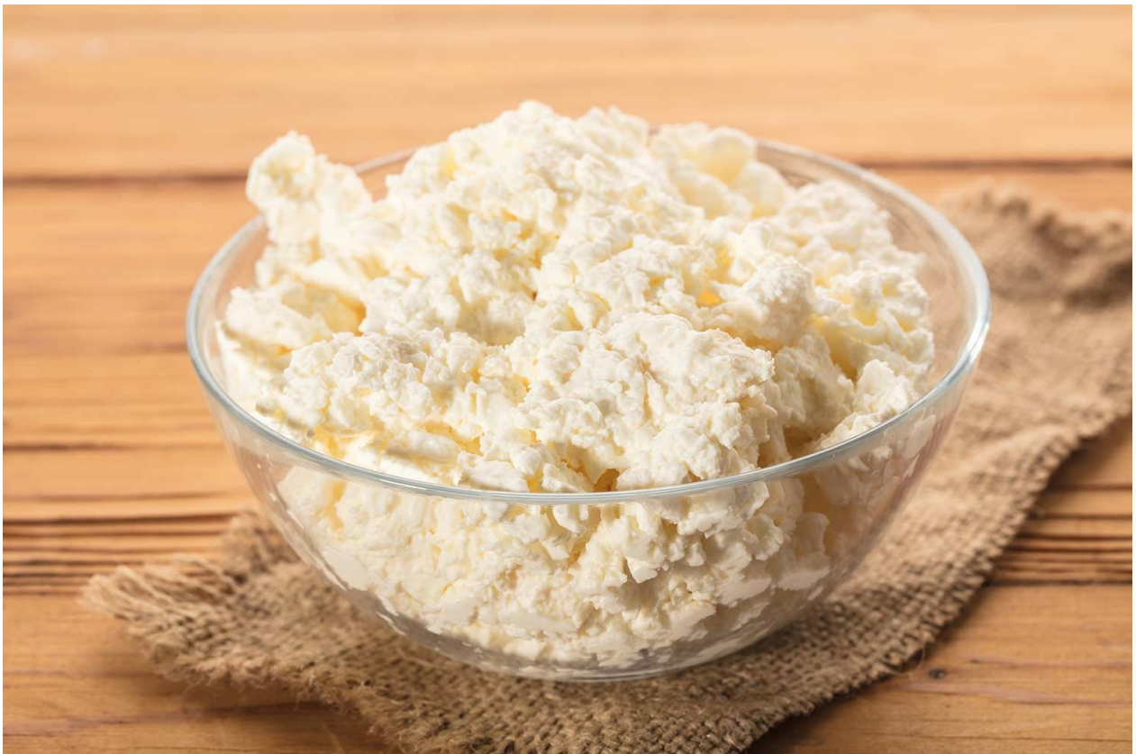
Cottage Cheese Recipe.

Good in the refrigerator, or equivalent temperature, for a week.