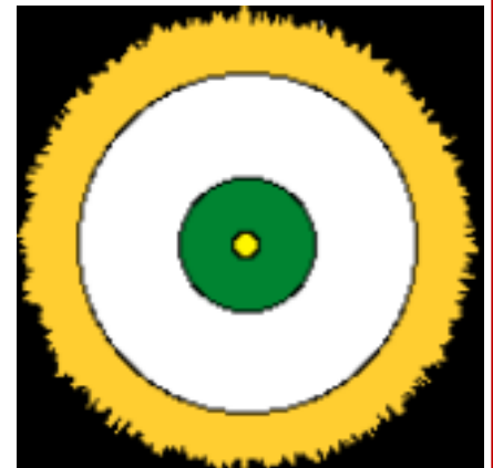
Period Bow Royal Round Target, from An Tir Book of Target

For further details on types of bows and shoots, please review the An Tir Book of Target!