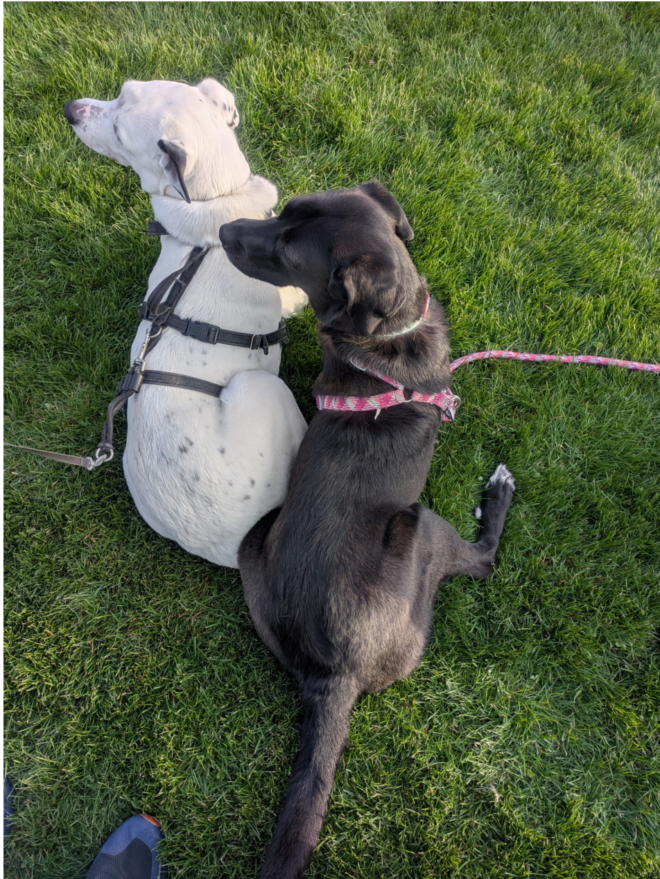
Skadi and Pik at Saturday evening Court, Baroness' War 2025

The Populace approved the motion, there were no Nays or Abstains.