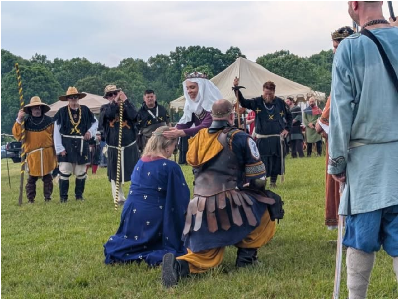
Countess Alianora Greymoor being made Crown Princess of Atlantia

Her Excellency would like to discuss re-upping the Zoom or other digital access media. Much discussion occurred about free and accessible options that do not require creating an account including Zoom, Discord, and Google Meet. A motion was made to allow the Web Team to research the options and the Finance Meeting was re-opened to approve up to $20 per month in pursuit of adding this tool for making our meetings and classes more accessible and available.