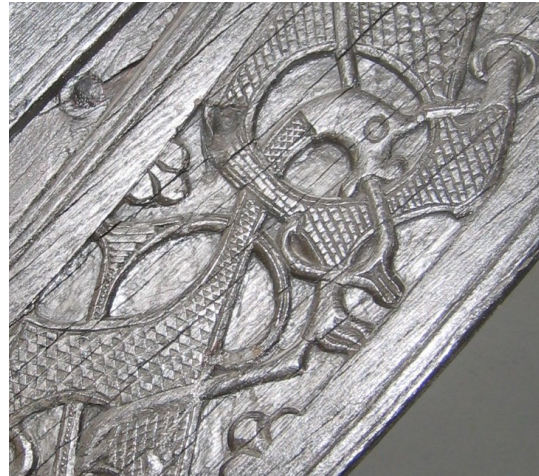
Details from the Oseberg Ship in the Viking Museum in Oslo, Norway. Wikipedia, CCBY-SA 2.5. Accessed 10/7/24 .

THL Furia is a Romano Celt from Caldonia, 350CE, and likes knotwork and mosaics.