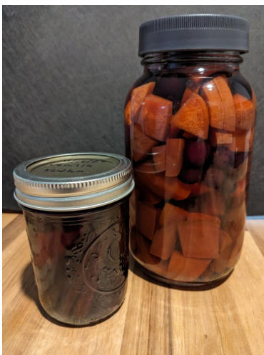
Vanilla extract and Apple Cranberry

Please bring your own mix-ins or plan on some to share around (apples, berries, etc), jars of your preferred size (we will have some available as well), and definitely your own vanilla. If there is a specific type of alcohol you prefer/need for your cordial or vanilla, please discuss with Halldora!