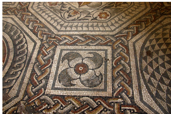
Blackfriars' Mosaic, Roman Leicester.