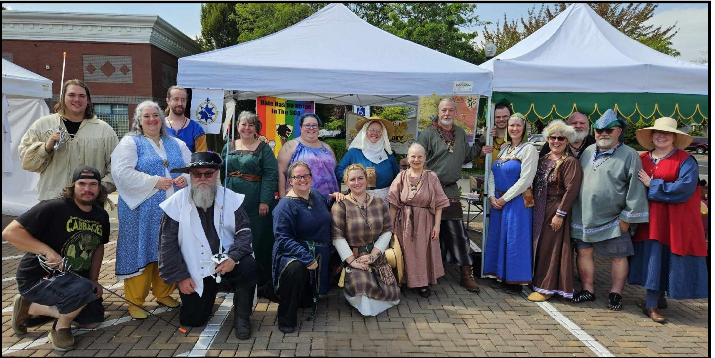
Shelton Medieval Market demo, August 2024. Members of Dragon's Laire, Glymm Mere, Blatha an Oir, and Wye-wood.