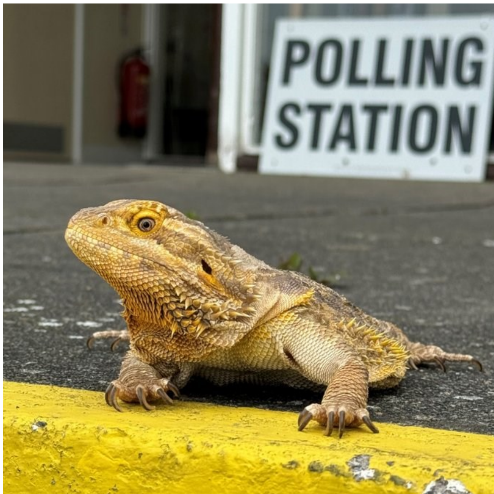
Photo credit: Henry the Bearded Dragon, posted by the Tendring District Council, Essex England, May 2, 2024.