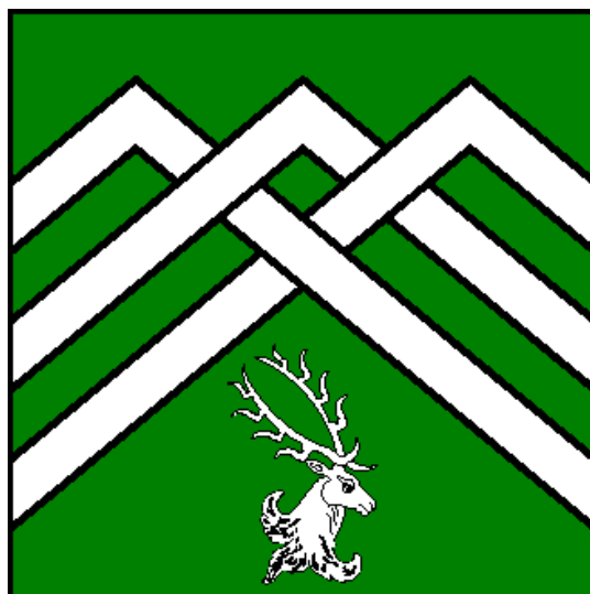
Proposed Device and Badge for the Canton of Misty Ridge.