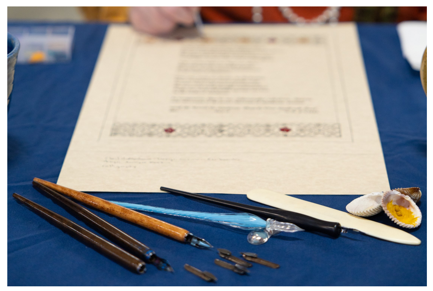
June Faire Scribal Table, B. McNeil 2024

Who you are, your relationship to the person you're recommending and your contact information (if applicable).