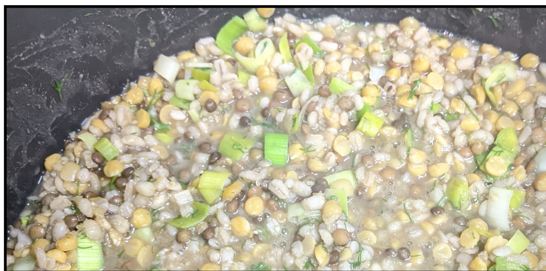
Final Simmer, Test batch, 2017

Equipment: Soup pot, skillet, cutting board, knife, teaspoon, Tablespoon, measuring cups.