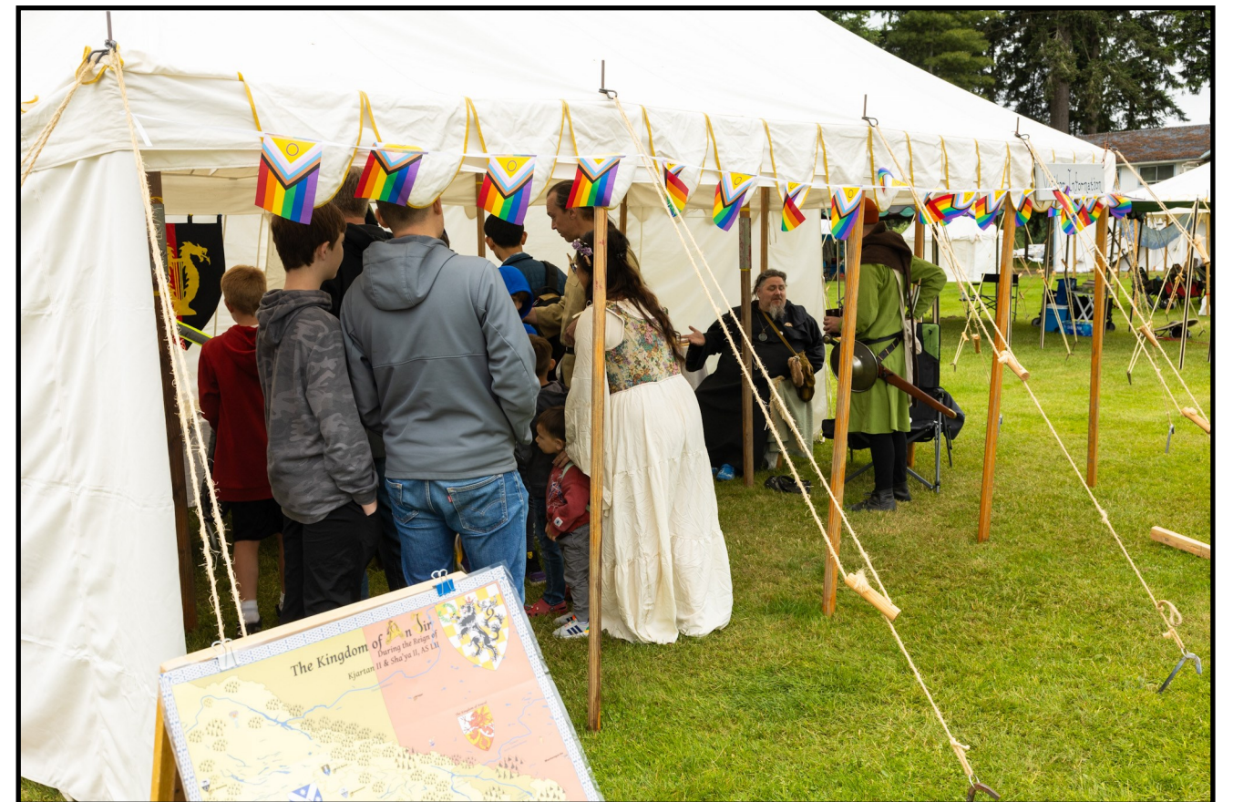
Chatelaine Pavilion, Kitsap Medieval Faire

Bid approved for the event, budget to be approved once updated and numbers confirmed.