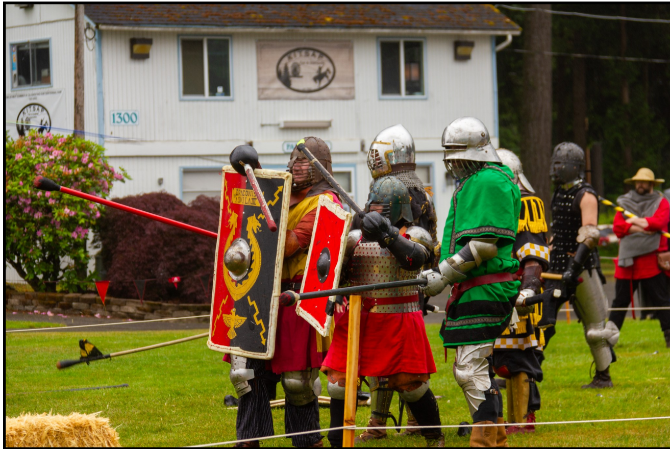
Warfield, Kitsap Medieval Faire 2024